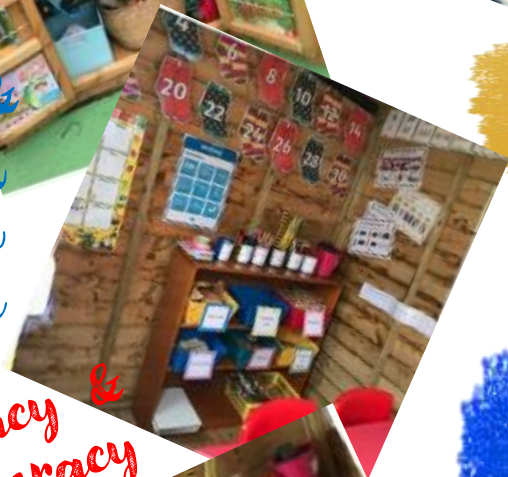
Literacy & Numeracy Shed